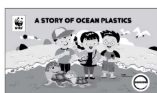
Marine litter story powerpoint slides