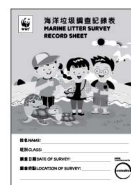
Marine litter survey record sheet