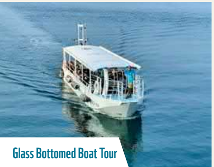
Glass Bottomed Boat Tour