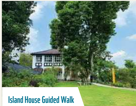
Island House Guided Walk