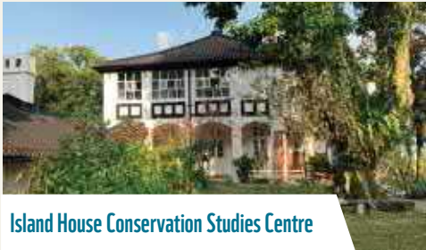
Island House Conservation Studies Centre