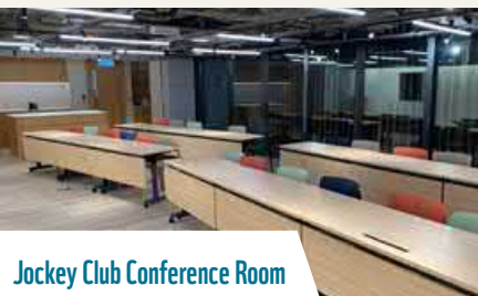
Jockey Club Conference Room