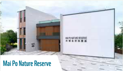
Mai Po Nature Reserve

Corporate and community groups are welcome to join eco-guided visits and activities at these WWF centres. Corporate membership provides various discounts for visits and activities. An easy to use booking system is available online.