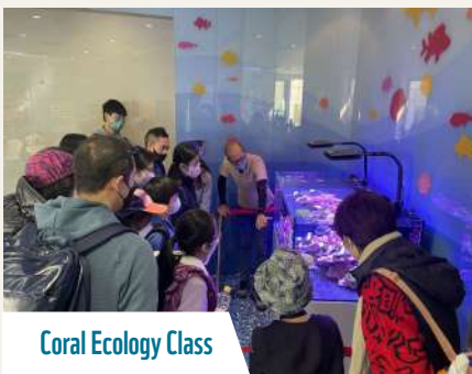
Coral Ecology Class