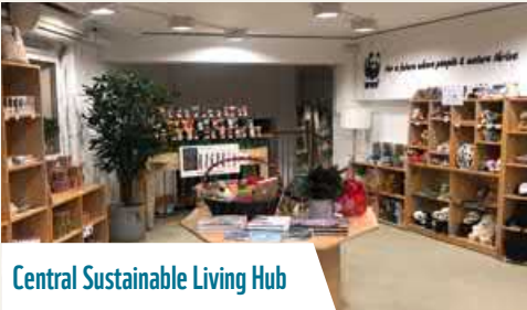
Central Sustainable Living Hub