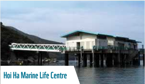
Hoi Ha Marine Life Centre