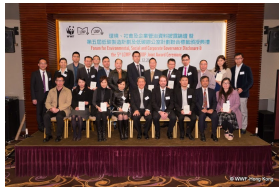
WWF – Hong Kong and awardees

On the same day as the ceremony, a forum was organized to discuss a hot industry topic: Environmental, Social and Corporate Governance (ESG) Disclosure . Government officials and representatives from various enterprises were invited to be guest speakers and lead discussions on ESG disclosure and the associated carbon reduction opportunities. The speakers highlighted the fact that ESG disclosure is becoming increasingly popular in the business world, partly because of the need to maintain company image, but more importantly as part of a risk management strategy which allows companies to plan for future challenges. Statistics were also presented, indicating that staff of enterprises which disclose their ESG performance have a greater sense of belonging to those organizations. Given that information disclosure is reliant on data availability, the Hong Kong government is planning to launch a Carbon Footprint Data Repository to help enterprises identify carbon reduction opportunities.