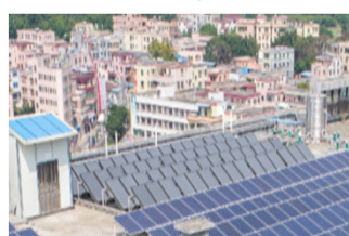
Solar water heaters