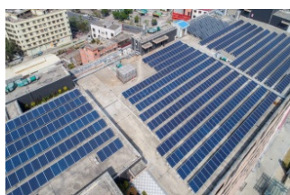
Solar PV panels