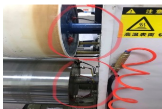
Upper & lower rollers of laminating machine