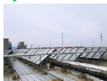
Solar heating & natural gas boiler hot water system